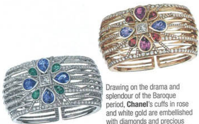
Drawing on the drama and splendour of the Baroque period, Chanel's cuffs in rose and white gold are embellished with diamonds and precious stones (price upon application)