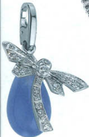
In a flutter of shimmering wings, a collection of delicate jewelled insects join Cartier's menagerie. We love this diamond dragonfly charm, delicately perched on a blue chalcedony stone. (RM47,900)