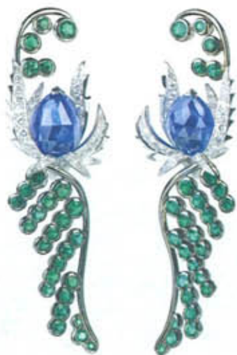
Inspired by Semiramis, the Queen of Babylon, these Boucheron earrings extend the entire length of the wearer's ear. Blackened gold holds together two pear-shaped cabochon sapphires, 108 emeralds and a sprinkling of diamonds. (RM1,243,200)