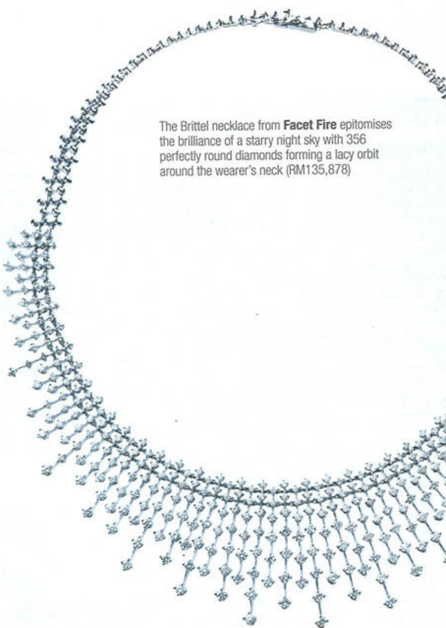
The Brittel necklace from Facet Fire epitomises the brilliance of a starry night sky with 356 perfectly round diamonds forming a lacy orbit around the wearer's neck (RM135,878)

Haute joaillerie exists not just as a display of inimitable craftsmanship and the beauty of rare gemstones, but also as a celebration of the creative nature of the artisans. In workshops all over the world, jewellery makers take inspiration from almost anything to create one-of-a-kind pieces that glitter with the depth of meaning.