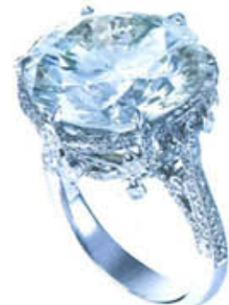
DeGem has lovingly crafted the 11-carat Golconda diamond — the world's clearest, purest and most flawless stone ever found — into a truly breathtaking piece (price upon application)