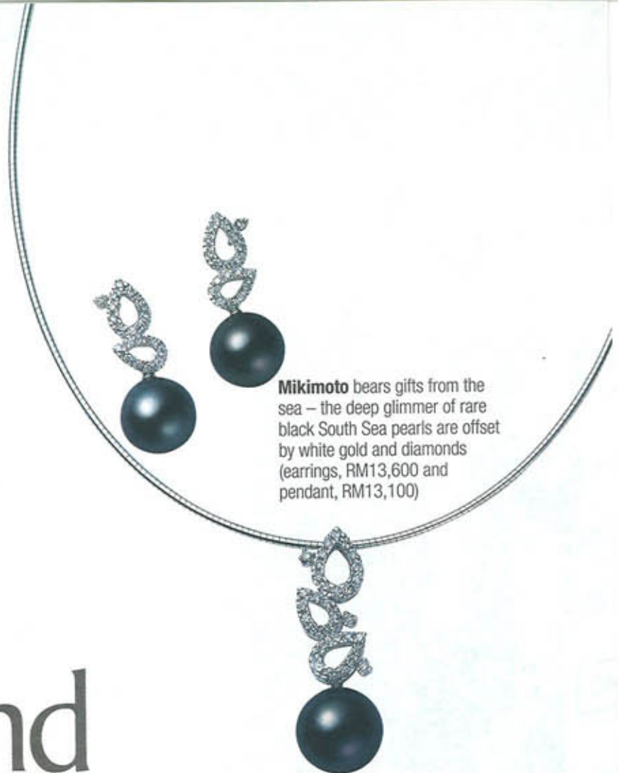
Mikimoto bears gifts from the sea — the deep glimmer of rare black South Sea pearls are offset by white gold and diamonds (earrings, RM13,600 and pendant, RM13,100)