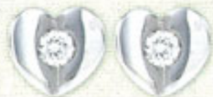
Selberan Jewellery Heart-shaped white gold & diamond earrings, RM1,750