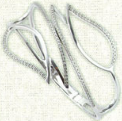
Brilliant Rose Nature-motif white gold bangle, RM15,798