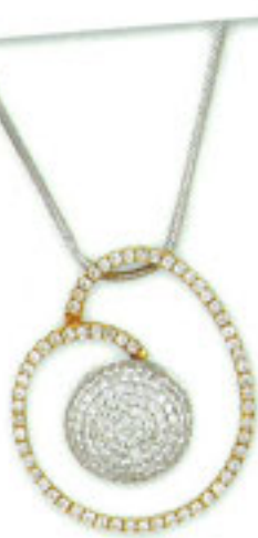
T.H. Jewelry Sleek yellow and white gold pendant (without the chain), RM8,862