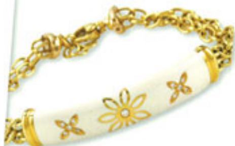
The Carat Club Yellow gold bracelet, RM6,519