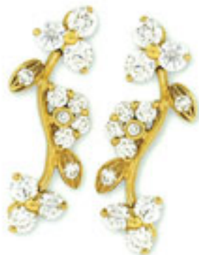
Selberan Jewellery Nature-motif earrings, RM12,500

Make a statement with strong, irregular pieces. Toss in a dash of yellow gold and you've got a stunning visual feast.