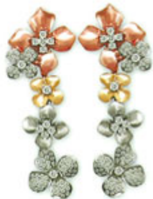
Diamond & Platinum Gold, rose gold and white gold diamond earrings, RM6,993