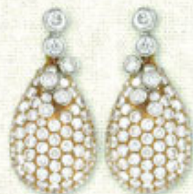
DeGem Diamond Diamond earrings, RM14,300