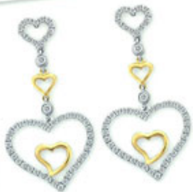
Diamond & Platinum Gold and white gold diamond earrings, RM3,312