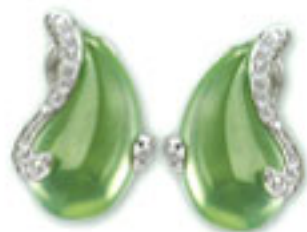
DeGem Diamond Pirenite earrings with diamonds, RM6,500