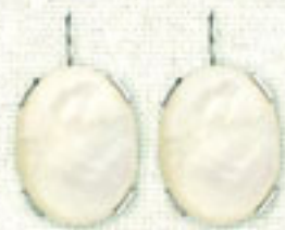
Thomas Sabo White pearl earrings, RM629