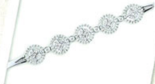
Diamond & Platinum Enigmatic Sparkles Collection bracelet, RM10,145

Classy, sleek and understated, these pieces are ideal not just for your big day, but for the many other days ahead.