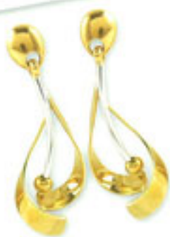
Tse Sui Luen Jewellery 18K White & yellow gold earrings, RM1,980