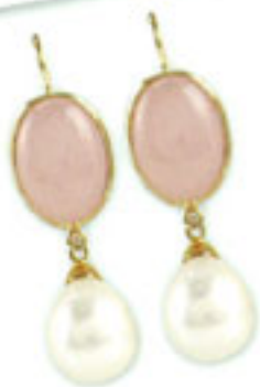
Thomas Sabo Pearl drop earrings. RM498