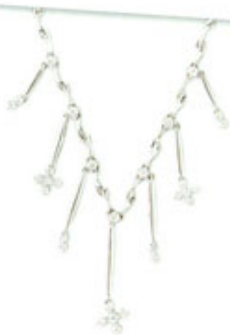
Love & Co. White gold necklace, RM5,748

Classy, sleek and understated, these pieces are ideal not just for your big day, but for the many other days ahead.