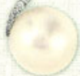
Brilliant Rose Necklace with single pearl, RM2,158