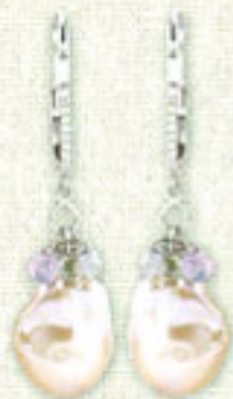
DeGem Diamond Fresh water pearl earrings. RM10,800