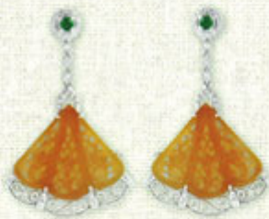
Tse Sui Luen Jewellery 18K Honey mustard jadeite earrings with diamonds, RM 17,600