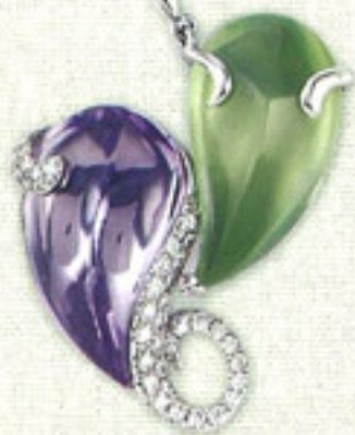
DeGem Diamond Pirene & amethyst necklace, RM4,500