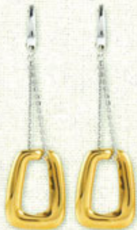
T.H. Jewelry Dangling earrings, RM2,705

Make a statement with strong, irregular pieces. Toss in a dash of yellow gold and you've got a stunning visual feast.