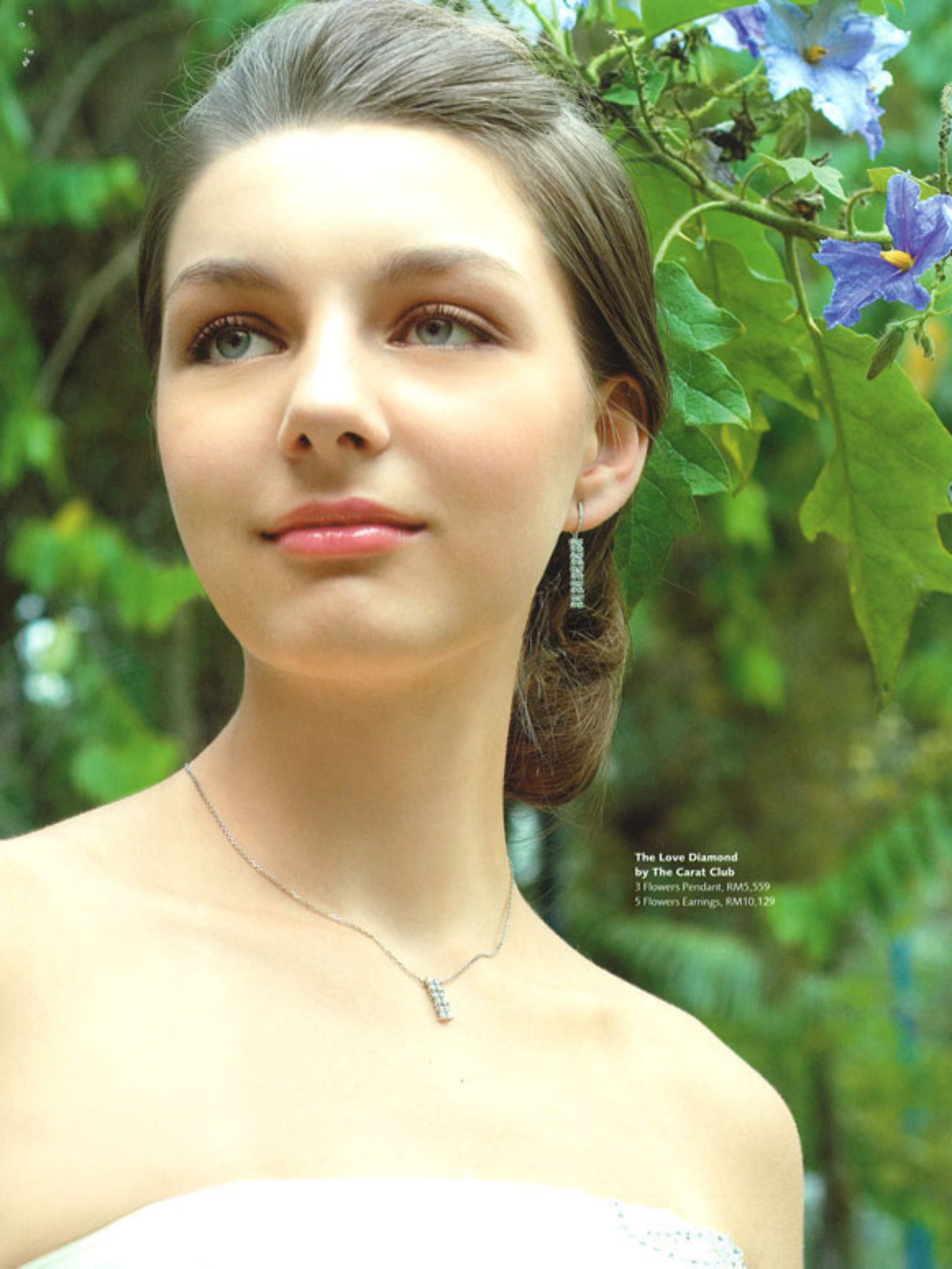
The Love Diamond by The Carat Club 3 Flowers Pendant, RM5,559 5 Flowers Earrings, RM10,129