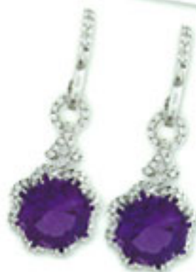
PYT Jeweller Dangling earrings with purple stones, Price unavailable

To create a little drama to your overall look, add small fleeting bursts of colour.