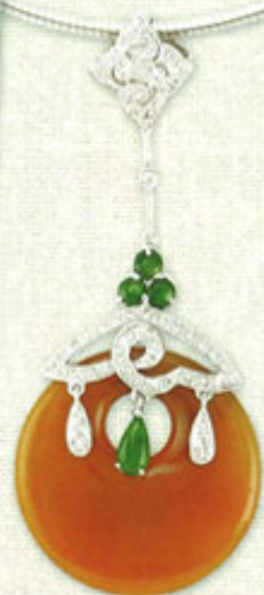
Tse Sui Luen Jewellery 18K white gold honey mustard jadeite with diamond pendant (without the chain), RM8,810

To create a little drama to your overall look, add small fleeting bursts of colour.